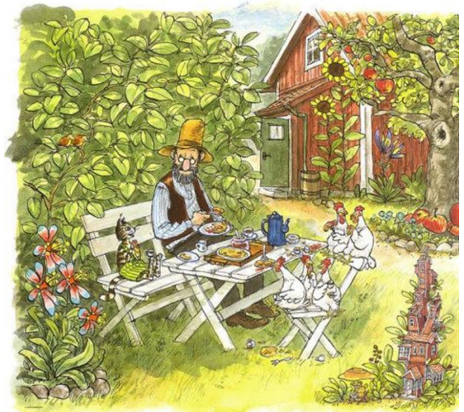
Figure 2: Nordqvist, 2007, p. 22

In Pettson and Findus , Pettson is making home with Findus the cat, and this home is clearly a queer kind of household. Pettson is Findus's surrogate mother, and Findus is both a cat and Pettson's child. Pettson is queered through this relationship, taking both a feminine responsibility as a mother, and a queer one as a mother of a non-human child. In addition to Findus, Pettson's queer home making extends to other creatures and things in and around the home.