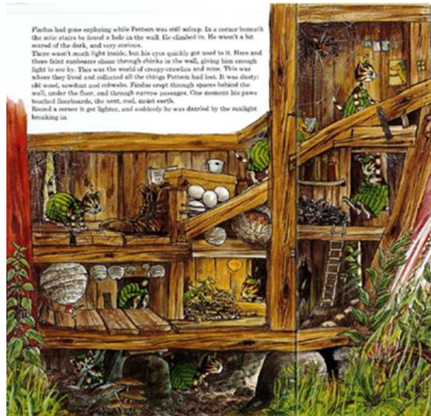
Figure 4: Nordqvist, 2008, pp.8-9

unknowingly, cohabitating with a variety of home making partners. When little Findus explores and finds the foundations of the house, he finds there are muckles living there who have tiny doors throughout the house. They seem to have taken some of Pettson's belongings, like a teacup, a pair of boots and some paper that looks like it may once have been important, however, it seems equally likely that the teacup just spawned here out of its own accord. Here we see that the borders between the natural and the artificial are porous and they leak into each other. It is unclear where the human influence over the house ends and the "natural" influence begins. The house, like Ingold details, is never a purely human endeavour, and is always constituted by many more-than-human factors.